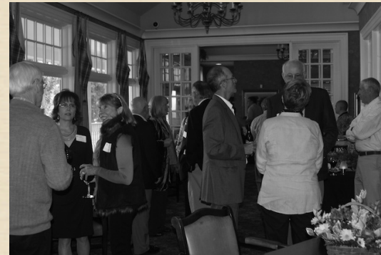
EHLT Lifetime Member Appreciation Event.

of land preservation tools and practices, half the board attended the annual Connecticut Land Conservation Council Conference. In addition to mailing newsletters, such as this, maintaining the EHLT Facebook page, and holding monthly meetings, EHLT's board created a new website ( www.ehlt.org ) that allows for online membership and improved email communication, plus listings of EHLT preserves, events, and news.