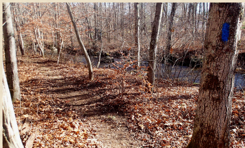
New Blue trail at Hidden Valley Farm preserve.

EHLT is extremely grateful to On The Rocks for donating the venue and appetizers, and to the anonymous donors who funded the evening's libations - donations that preserved EHLT's limited coffers.