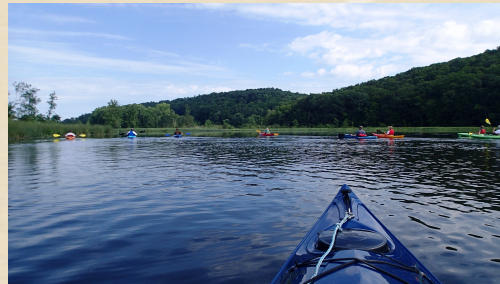
EHLT paddle to Chapman Pond.

Land Trust-led hikes and paddles engaged many in outdoor activities and helped educate participants about area lands and waterways. These events explored the Dean Easement, Hatch Lot and Patrell preserves, Devil's Hopyard, Hurd State